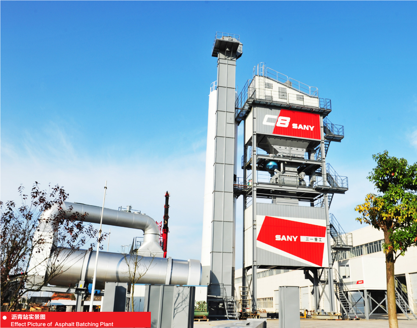
● 沥青站实景图 Effect Picture of Asphalt Batching Plant